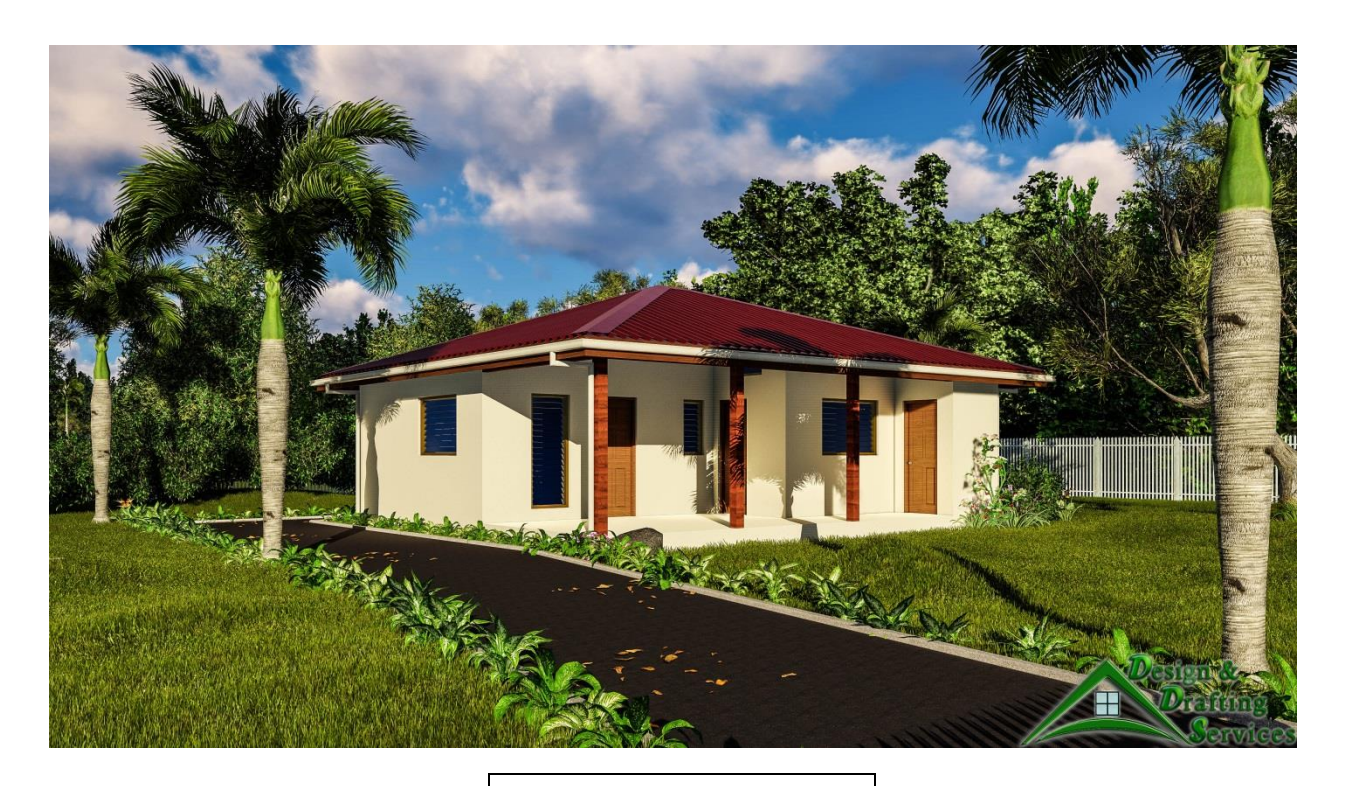
Back Door as Main Entrance