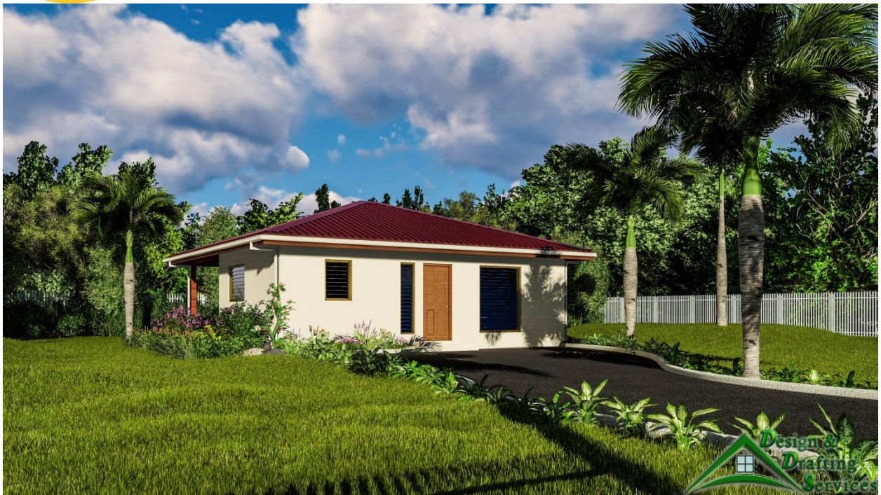
Front Door as Main Entrance