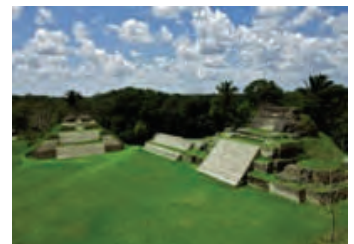
Belize offers lots of ancient Mayan culture and history

7. You can buy a home for less than $100,000. If you're interested in a place in the Caribbean sun...but you don't want to pay typical Caribbean prices...you need to consider Belize.