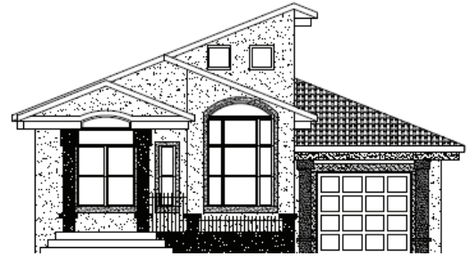
Elevation with Vaulted Ceiling (garage is optional)

The Finch 1 bedroom, 1 bath Starting at $98,000*