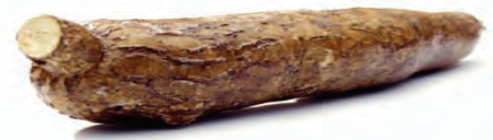
Lots of Cassava is onsite at Camino

Cassava is also known as yucca, coco is the spanish macal.