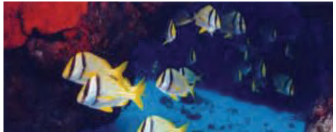
Marine life comes alive in the night light

Emotions and sensations are also heightened during this time as the diver's body has a different sense of orientation. This slow motion of the diver's lights against the dark ocean is a thrilling image in itself. Although visibility under the water is restricted by the darkness, at night the clarity of the water is often very good. However, night diving is considered a much more risky activity than day diving, so it requires much more concentration. It is best to night dive in small groups and in places where day dives have been done before. It is a trip into another world.