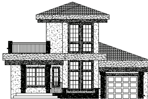
Elevation with rooftop patio (garage is optional)

*Price is based on a home constructed on a one-quarter acre parcel. The final construction price may be lower for previously purchased lots or higher for larger sized parcels