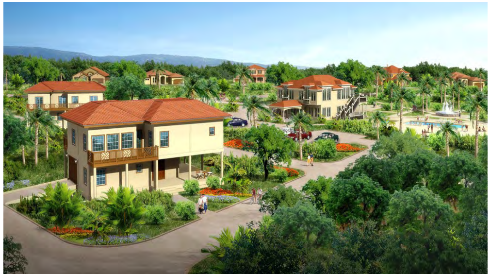
Camino Del Rio—An eco-based community of the future

park is your home ” personifies this by intermingling nature trails throughout both the residential and recreational areas of the compound. Over six miles