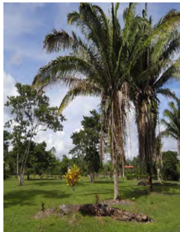
The lush landscape at Camino

With your story, also provide the following: (email to info@tareig.com )