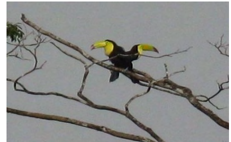
Toucans near Palm Grove Circle