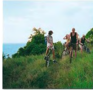
Mountain biking in the Caribbean is a unique vacation experience

week-long festival sponsored by Island Bikes is being held this year in November. Whether or not you're around for the festival, you'll have no shortage of challenging trails to choose from. One of the most spectacular off-road