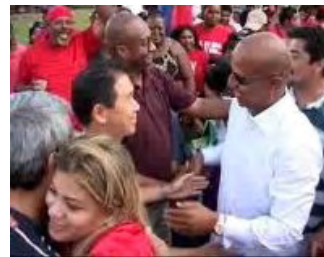
Dean Barrow with constituents

Minister of Foreign Affairs and National Security, and Attorney General.