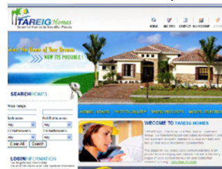
Tareighomes Website will be available by late Spring, 2008

keep in touch with the development activity during the critical construction stages including foundation setup, exterior walls and roof, interior walls, and final completion. This new site will save time and money while still providing owners control of the home construction process.