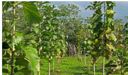
Teak tree Garden