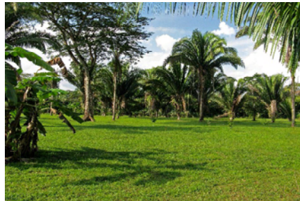
Open space in the recreation area