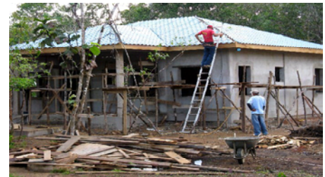
Second Model home under construction