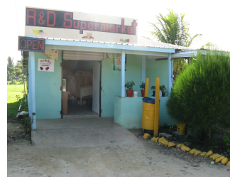
R&D Market on the Main Road

brings the convenience to many. Produce, meat, and household goods are offered at competitive prices and