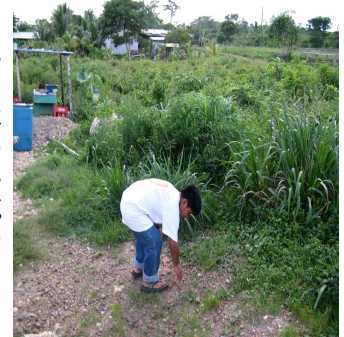
Youth assist in clean-up effort

cans have been provided and placed in key locations in the village; at the bus stop, school, and the Market Place. The nearby Belize Zoo provides recycling containers and the residents are being educated on ways to become more conscious of good conservation practices. Residents have also been encouraged to recycle trash and waste, to keep the areas around their homes clean, and to pick up trash along the roadside. On a weekly basis, local youth empty the contents of the full trash cans and cleanup any nearby