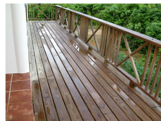
Relax on your backyard deck

A Home-Building Specialist is also available toll-free at (800) 661-4838 to assist you from the beginning until you move in. Select your home style and start saving today.