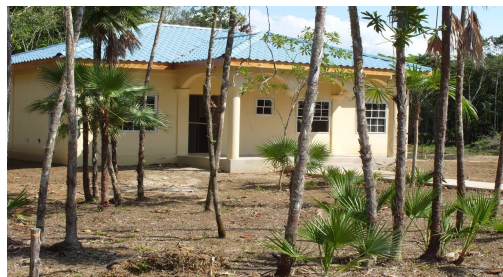
Second Model home under construction