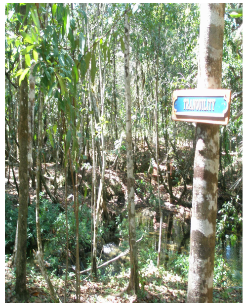
Tranquility Resting Place