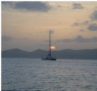
Caribbean Sailing is growing in popularity

End your sailing in Belize with a trip through its colorful history at the Maya ruins at Tikal and get a glimpse of the culture and the people of the local area.