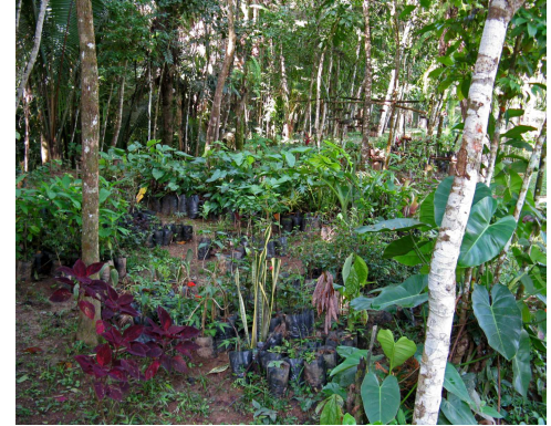
Various native plants are grown onsite for landscaping use

important aspect to maintaining the beauty of the property. The design and planning of Camino Del Rio incorporates sustainability and green building principles as a foundation to the environmental preservation strategy.