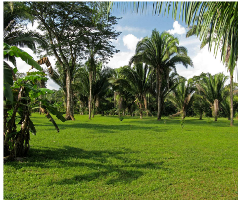
Residents enjoy lots of open space at Camino

As part of TAREIG, LLC's mission to develop high quality real estate projects in emerging travel destination areas, projects are focused on enhancing the natural features and environment of the property and to utilize environmentally sound preservation practices. Belize has become one of the world's most biologically diverse nations with the integrity of its natural resources still very much intact. It boasts 93% of its land under forest covers, the largest coral reef in the western hemisphere, the largest cave system in Central America, over 500 species of birds, thousands of Mayan archaeological temples, and the only jaguar reserve in the world. As an overall country mandate and through the efforts of the Protected Areas Conservation Trust (PACT), Audubon Society and many other organizations, support for the conservation, preservation, enhancement, and management of Belize's natural resources and protected areas has become an important country attribute. This focus on the protection of its natural resources aligns with TAREIG's focus to develop projects that emphasize the maintenance of the natural beauty of the site's location.