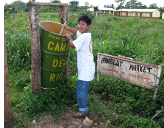
TAREIG supplied trash cans

TAREIG Limited and the Camino Del Rio community are participating with other local businesses to support the Frank's Eddy Village in an ongoing national campaign to maintain the beauty and cleanliness of Belize. Trash