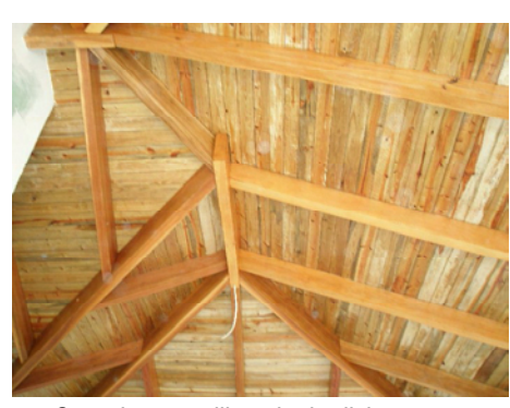
Open beam ceilings in the living room