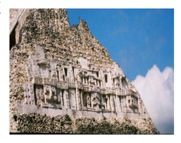
Visit one of many Mayan ruins in Belize for a rich, cultural and historical experience

Visit the website at www.frescoadventure.com for the detailed itinerary or call (301) 352-5272 to book your reservation today. Looking forward to seeing YOU in Belize.