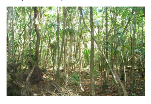
Lots of trees and shade on Phase 2 parcels