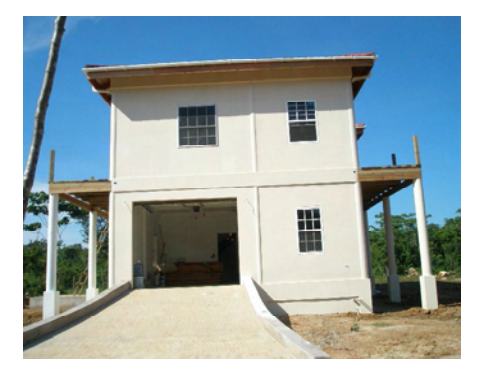
Garage Opening Right Side