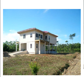
Front right corner view