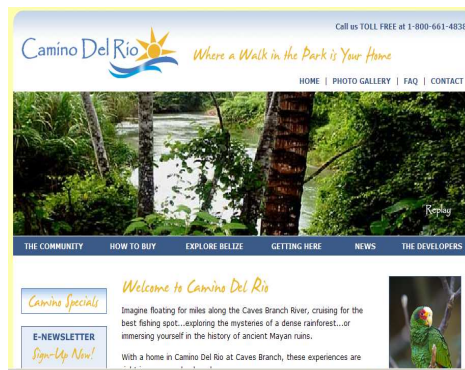
New Home Page for Camino Del Rio

Have you seen the new infomercial? Featuring the Camino Del Rio theme song, the new infomercial will be seen on a number of websites around the globe to promote eco-living in the English Speaking country of Belize. Visit the site soon and check-out what's new and interesting in Belize.