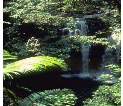
Hiking in a rainforest is a unique vacation experience

International efforts are always in progress to offer protection and slow-down the deforestation of rain forests so that its beauty can be enjoyed by many in the future years.