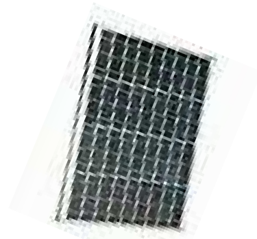
Solar Panel use is one way to save on energy

These are just a few of the ways that sustainability can be maintained. As eco-friendly living becomes more popular and in demand, it will appeal to people as a great way to make a contribution to the environment while at the same time investing in a beautiful country can be viewed as an "investment with a conscience".