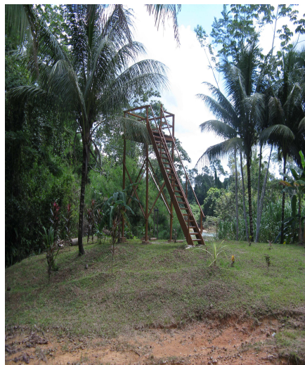
Bird watch tower overlooks the river