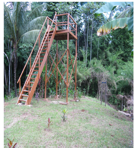
Tower view and beginning of the Jungle Trail