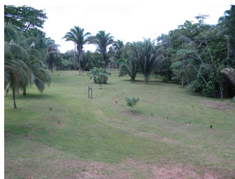
Views from Top of the Bird Watch Tower